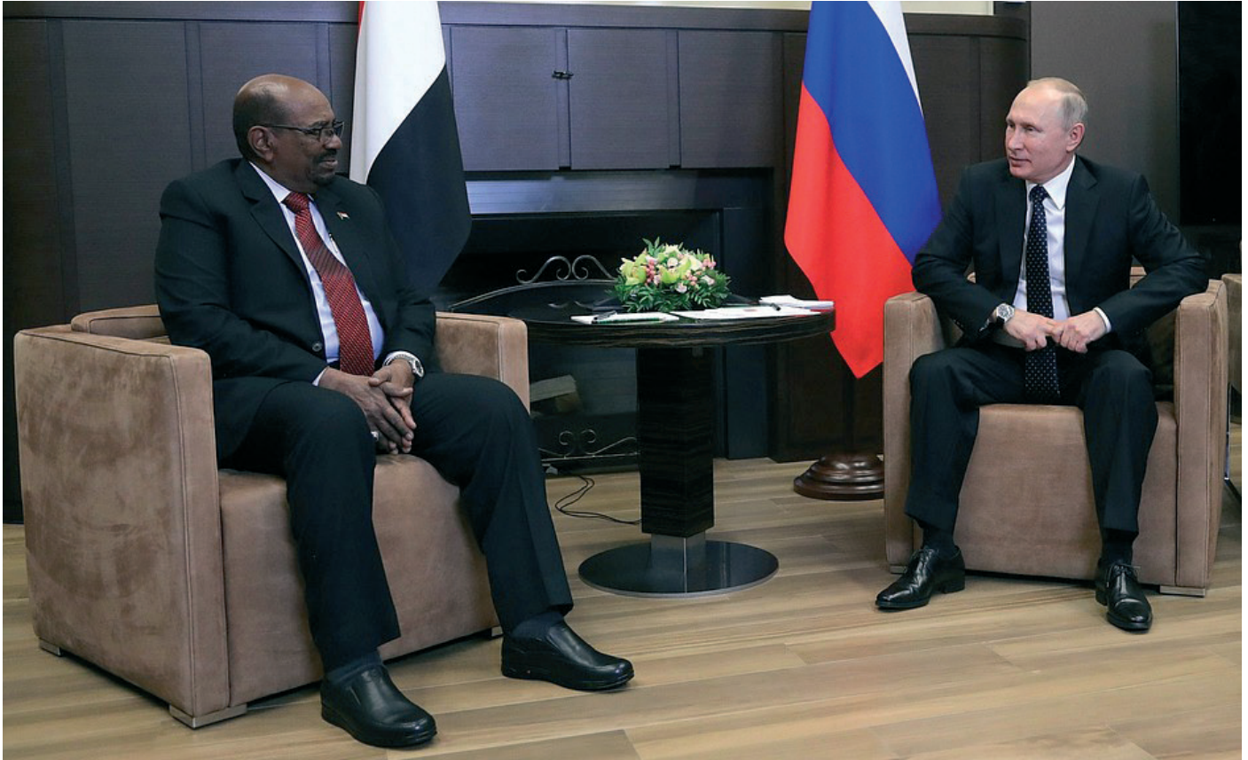
Vladimir Putin and Omar al-Bashir, November 23, 2017