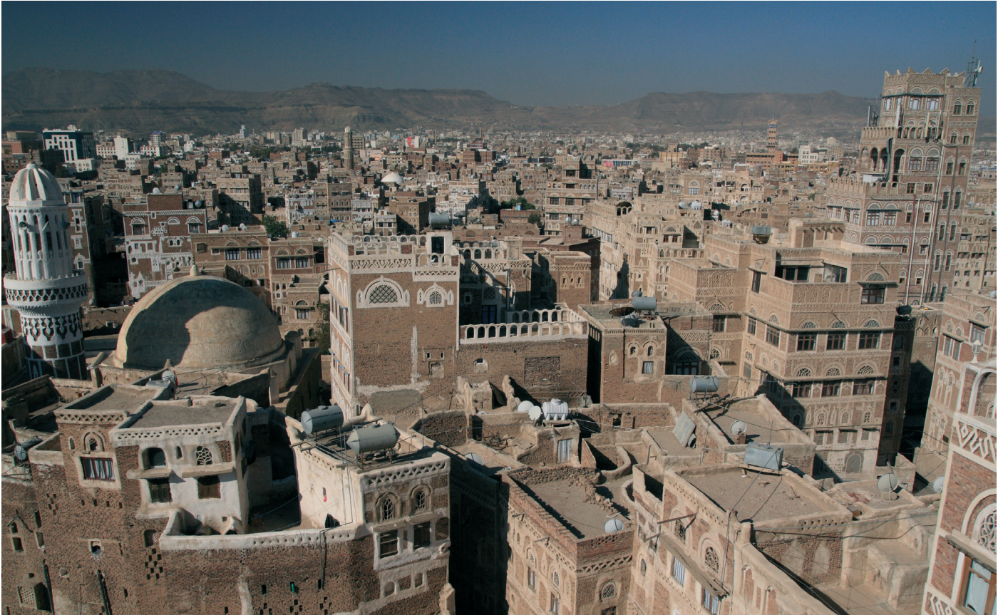
View of Sana'a, Yemen