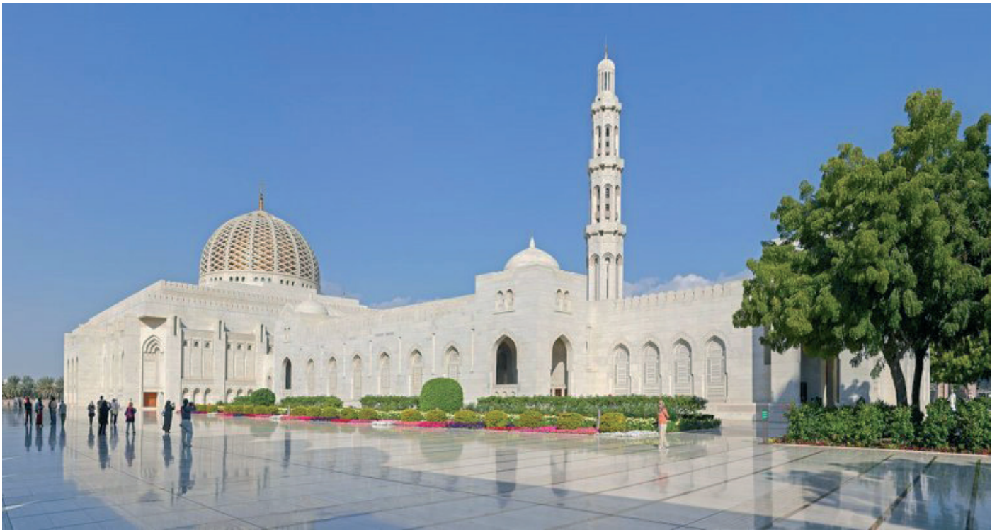
Sultan Qaboos Grand Mosque, Muscat, Sultanate of Oman, 2014