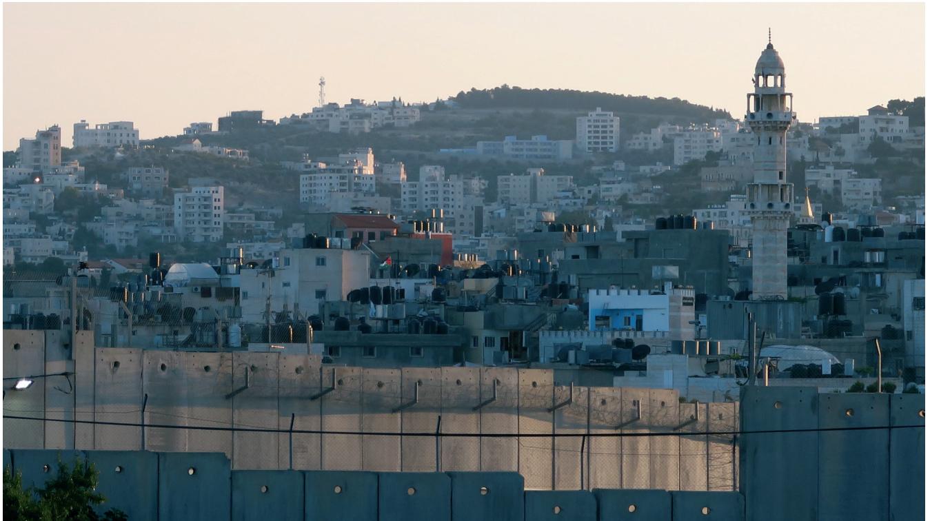
Aida Refugee Camp, Palestine, May 30, 2015