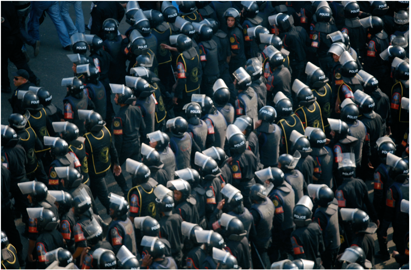
Rows of Egyptian Central Security Forces quelling 2011 Egyptian Protests in the Day of Anger 25th of January, 2011