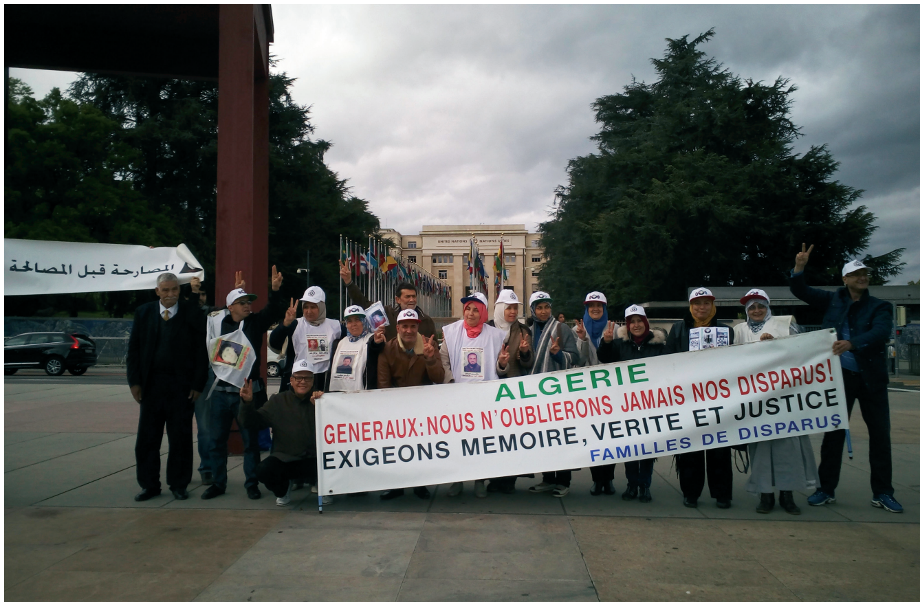
Families of the disappeared, Geneva, May 2017