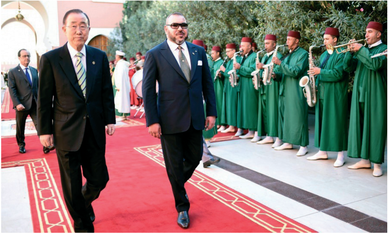
Ban Ki-Moon and King Mohammed VI, November 15, 2016