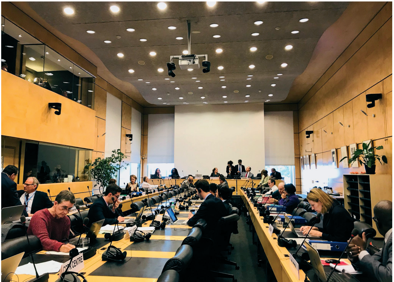
Jordan's review at the Human Rights Committee, October 2017

In its concluding observations of November 2017, the HR Committee expressed concern over such a broad definition of terrorism, which can be used to "stifle dissent". The UN experts recommended that Jordan ensure that terrorist acts are defined in accordance with international standards.