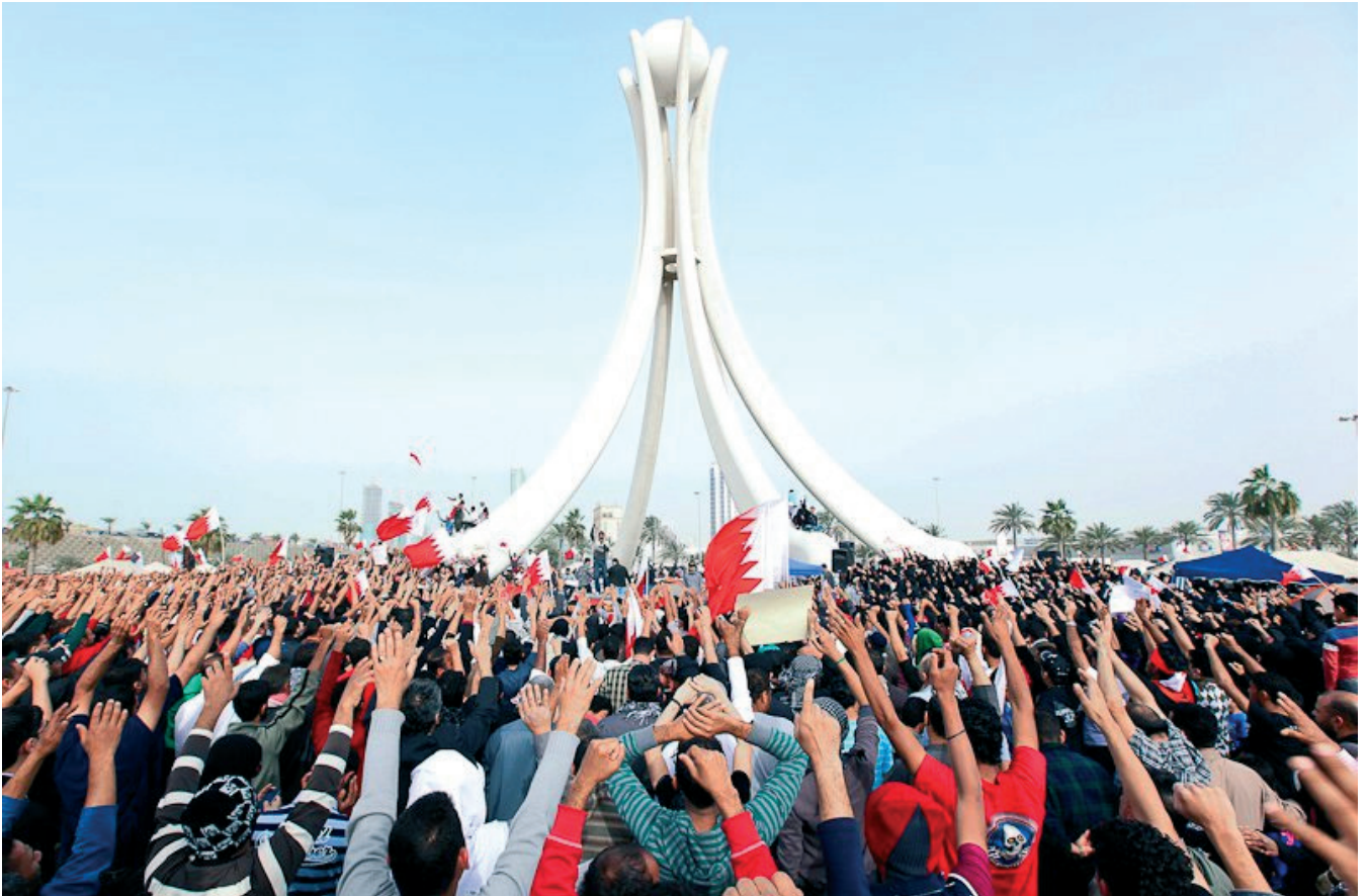
Protesters at Pearl roundabout, Manama, February 2011