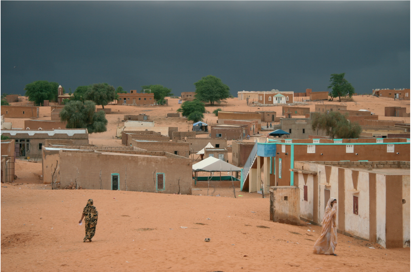
Bareina, Mauritania, (Source: Ferdinand Reus/Wikimedia Commons)