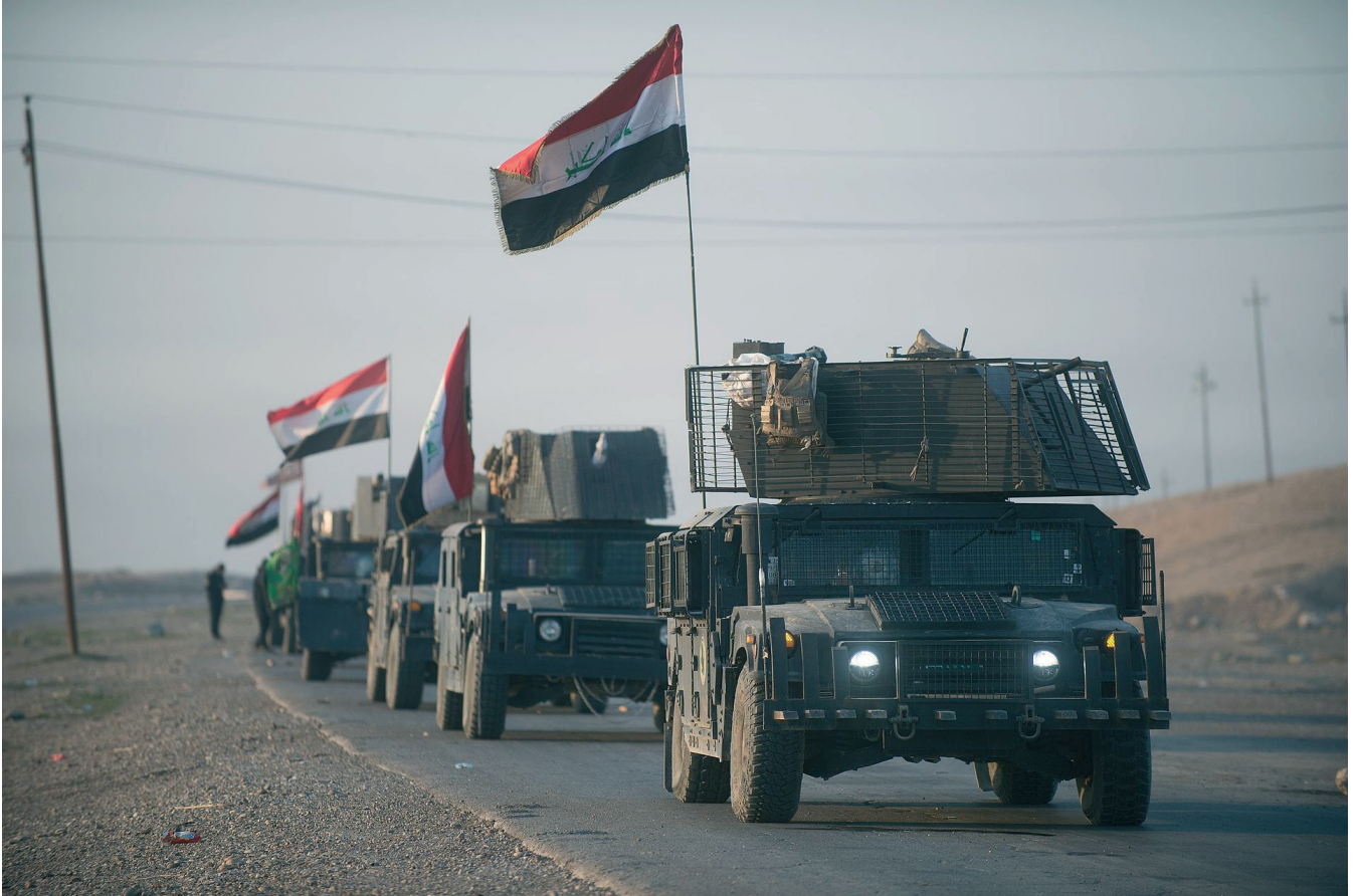
An Iraqi Counter-terrorism Service convoy moves towards Mosul, Iraq, February 23, 2017