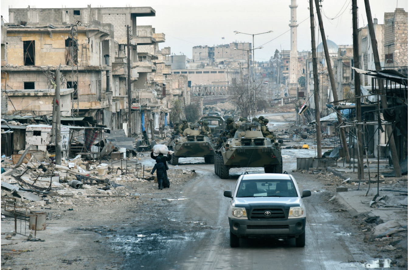
International Mine Action Center in Syria (Aleppo), December 23, 2016