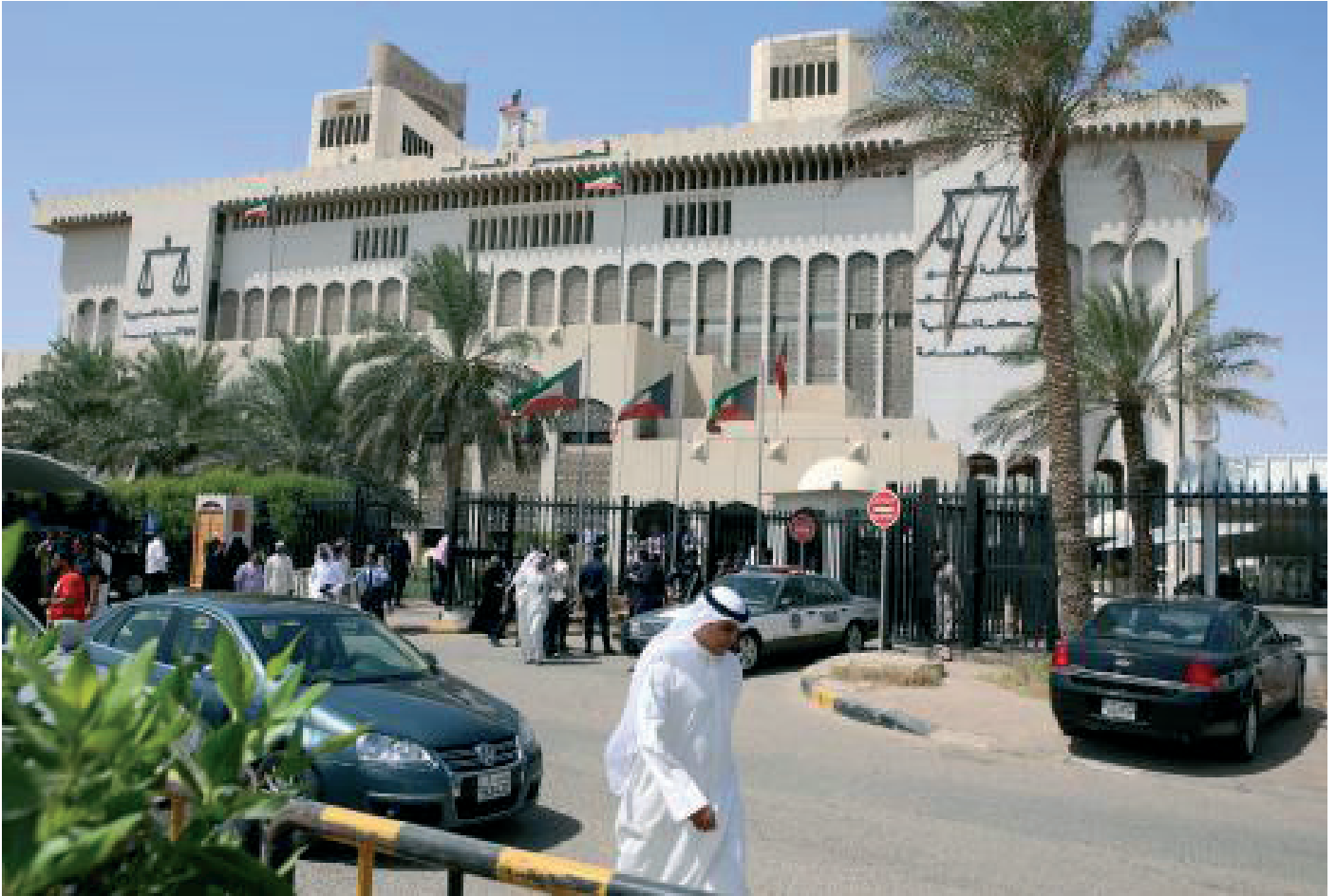
Kuwaiti Appeals Court