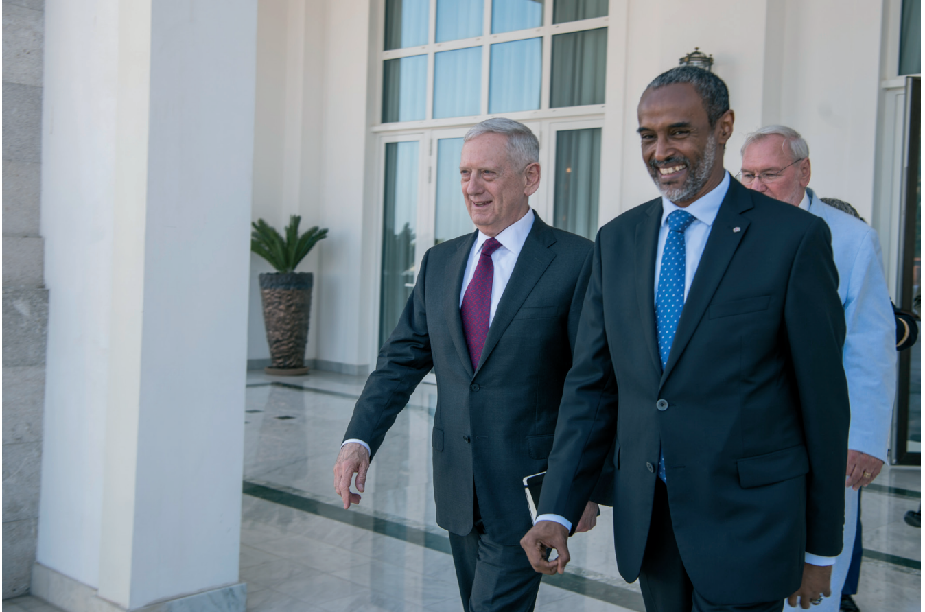
US Secretary of Defense Jim Mattis meets with Djibouti's Minister of Defense Ali Hasan Bahdon at the presidential palace in Djibouti City, Djibouti, April 23, 2017