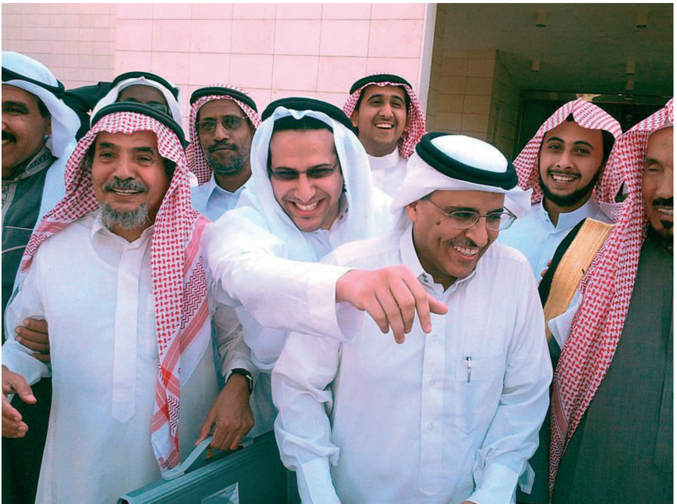
Members of the Saudi Civil and Political Rights Association (ACPRA)

Saudi Arabia continues to use the pretext of countering terrorism to crack down on any peaceful dissenting voices. In order to prosecute human rights defenders and anyone critical of the