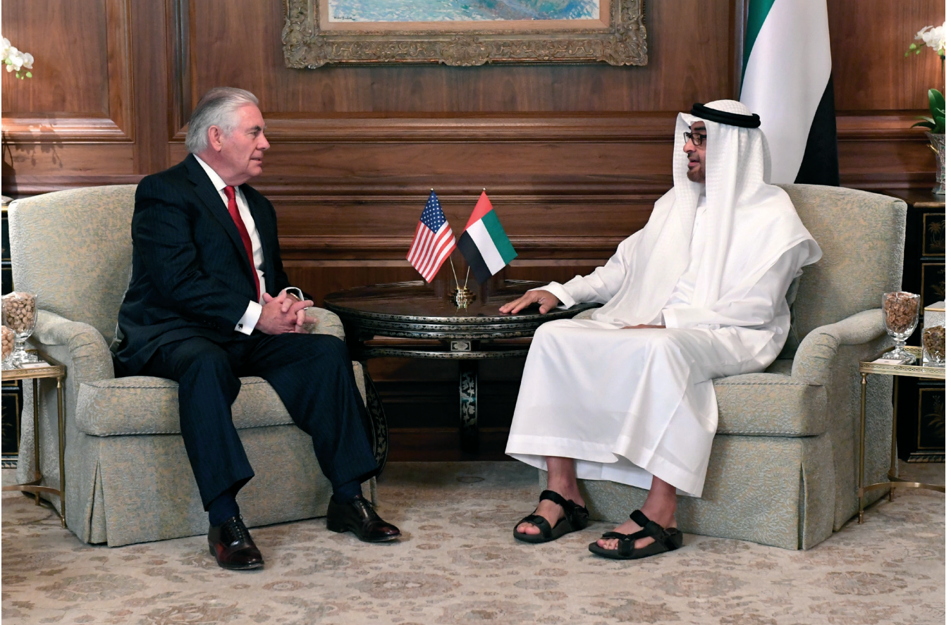
U.S. Secretary of State Rex Tillerson meets with UAE Crown Prince Mohammed bin Zayed in McLean, Virginia, May 16, 2017