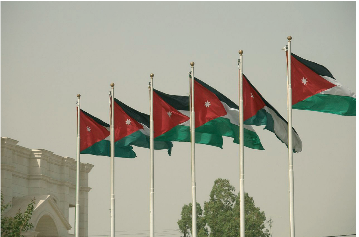
Jordanian flag, Amman, Jordan