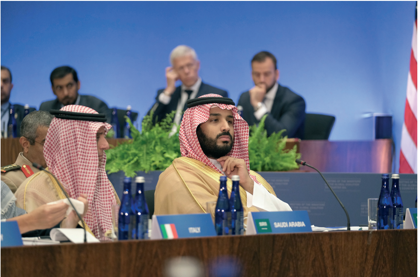
Crown Prince Mohammad Bin Salman bin Abdulaziz Al-Saud Participates in the Counter-ISIL Ministerial Plenary Session, July 21, 2016