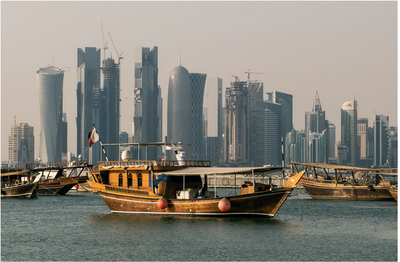
Corniche, Doha, Qatar, (Source: StellarD/Wikimedia Commons)