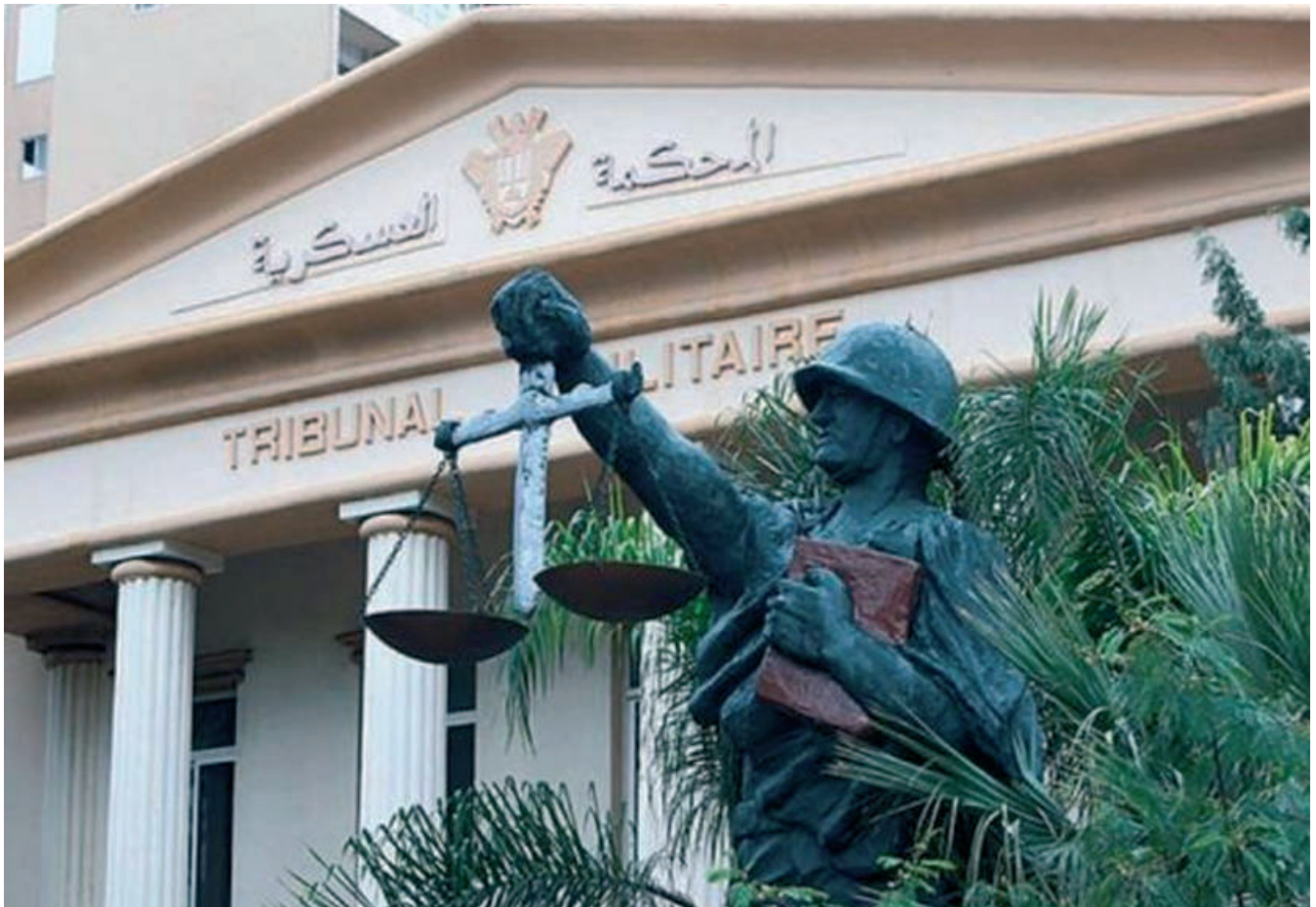
Lebanese Military Court