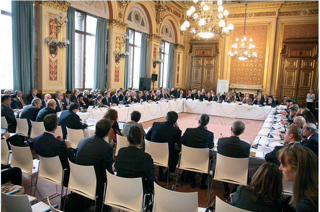
UN Support Mission in Libya (UNSMIL) conference, October 19, 2015