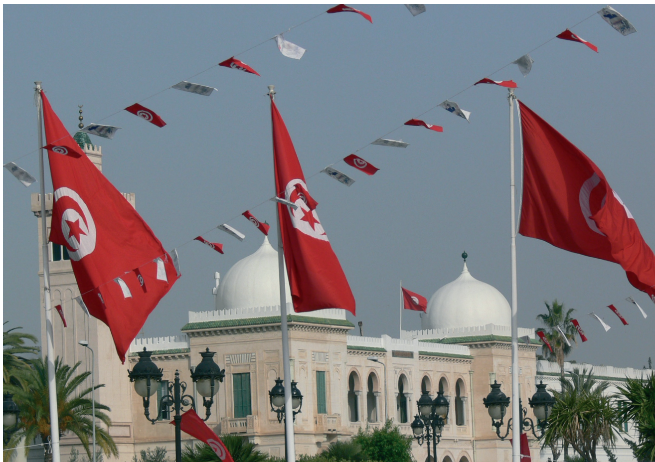
Government buildings in Tunis